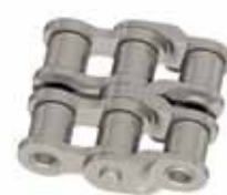
No. 15 (C)