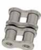
No. 4 (B)