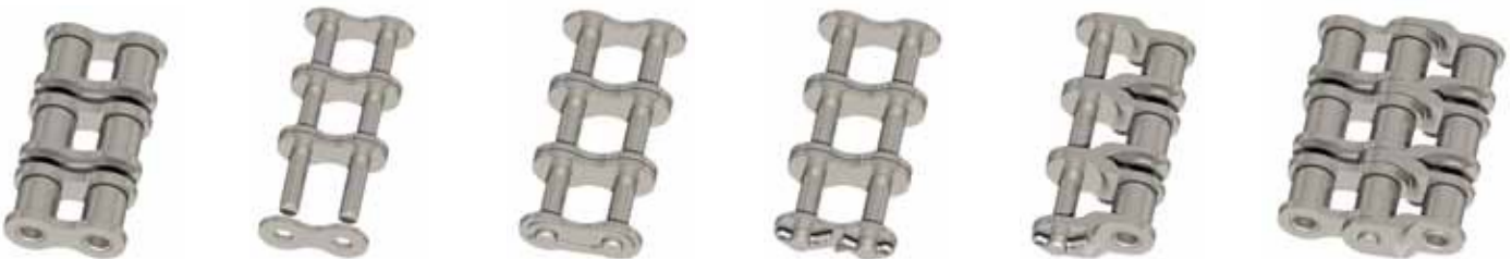
No. 4 (B)