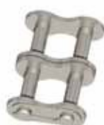
No. 11 (E)