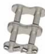
No. 111 (S)