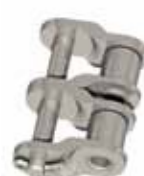
No. 12 (L)