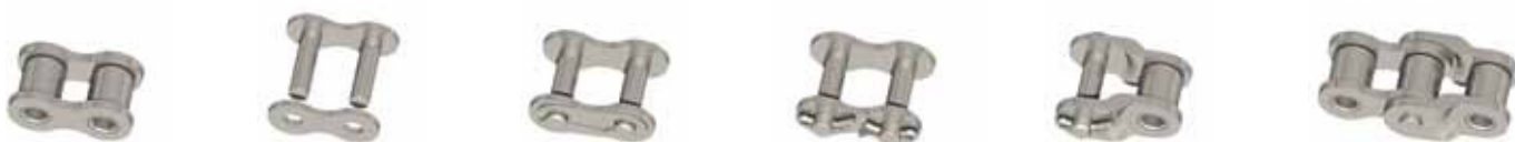
No. 4 (B)