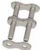
No. 7 (A)